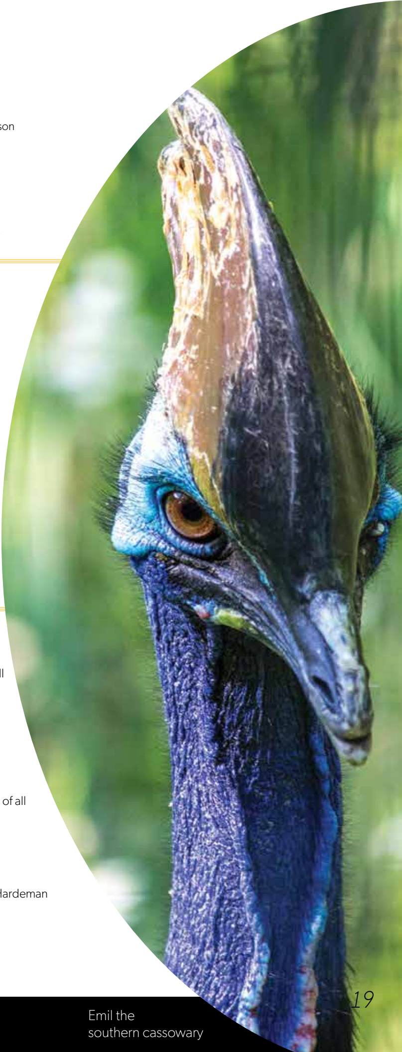
Emil the southern cassowary