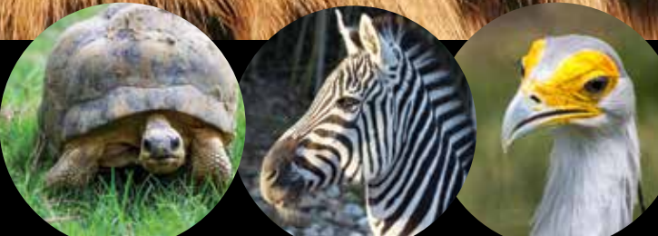
L to R: Booker the radiated tortoise; Sam the Grant's zebra; and a secretary bird.