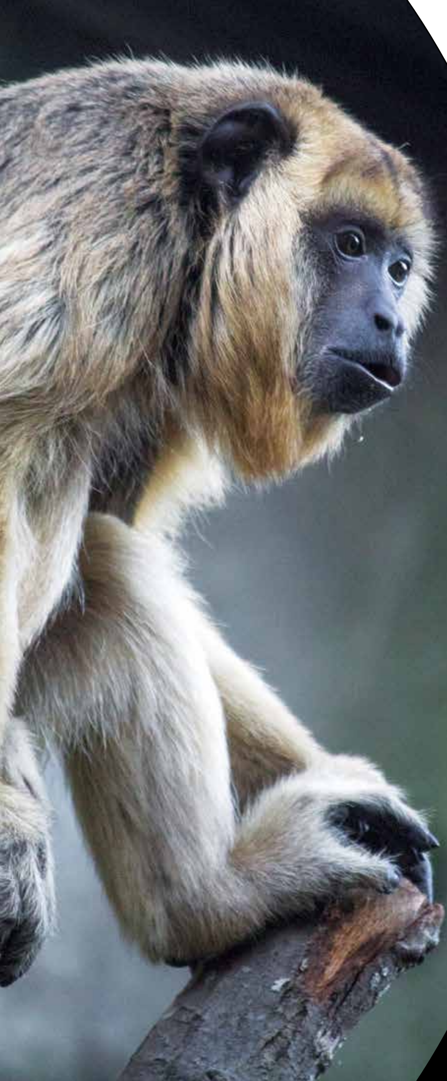
Matea the black howler monkey