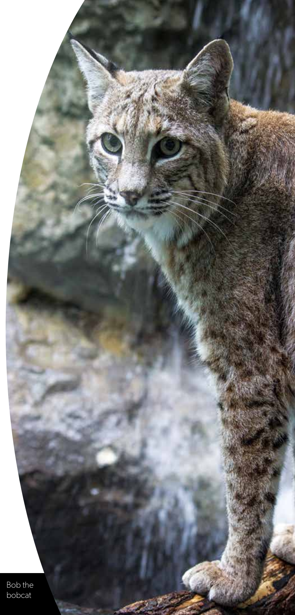
Bob the bobcat

*Gifts of $500 or more Jan 1 – Dec 31, 2019