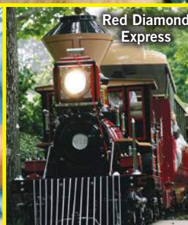
Red Diamond Express