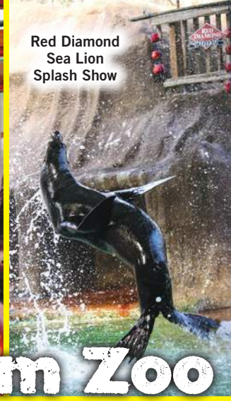
Red Diamond Sea Lion Splash Show