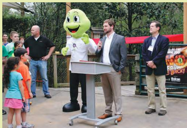
The Big Green Ant, DC's mascot, welcomed guests to the opening of Dino Discovery— They're Back!

Birmingham Zoo Members also receive 10% off any service from DC Scientific Pest Control. The Zoo is pleased to continue its partnership with DC Scientific Pest Control, and looks forward to a bright and pest-free future.