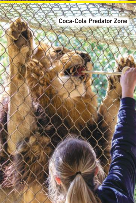
Coca-Cola Predator Zone