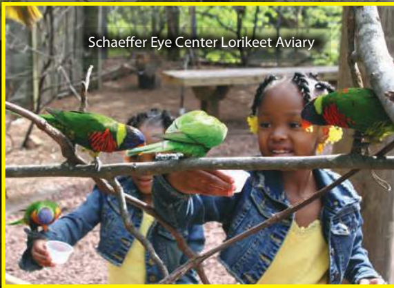
Schaeffer Eye Center Lorikeet Aviary