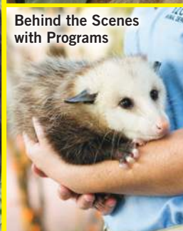
Behind the Scenes with Programs