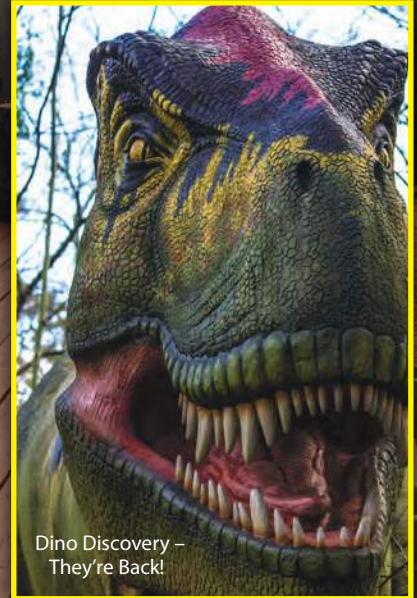
Dino Discovery - They're Back!